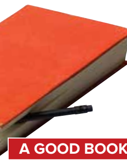
A GOOD BOOK

As you explore the vast array of outdoor activities, it's important to stay hydrated. Whether you are window shopping Downtown, biking our interconnected trails, or running in one of our community races, you'll always be close to the water. As one of the world's most well-read regions, you'll want to find a peaceful park or quiet coffee shop to curl up and get lost in a good book. If you didn't bring a book, you can always browse the endless aisles of one of several locally-owned bookstores.