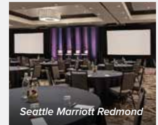
Seattle Marriott Redmond

Host your event in Redmond , and you may qualify for financial grant support. Be sure to apply for an annual event grant to offset your marketing expenses.