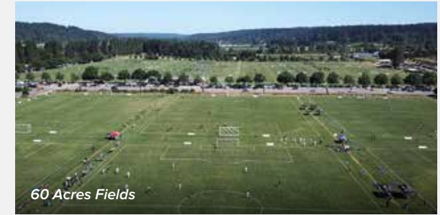
60 Acres Fields

Home to the world's smartest and most innovative technology leaders, Redmond offers a diverse and eclectic collection of event venues to enhance your next group gathering. With a unique array of indoor and outdoor spaces, meetings are more fun in Redmond.