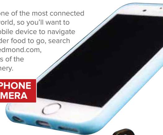
SMART PHONE WITH CAMERA

Redmond is known as the Bicycle Capital of the Northwest. We have over 40 miles of bike trails and a 75-mile bicycle system. Bring your bike, and be sure to pack a multi-tool to keep you rolling. Or, pick up the supplies you need at one of our incredible bicycle shops.