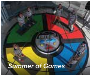
Summer of Games