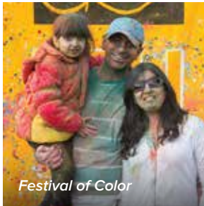
Festival of Color