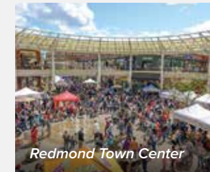
Redmond Town Center

Host your event in Redmond , and you may qualify for financial grant support. Be sure to apply for an annual event grant to offset your marketing expenses.