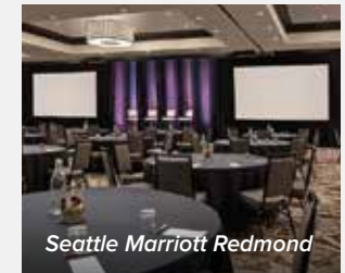
Seattle Marriott Redmond

Host your event in Redmond , and you may qualify for financial grant support. Be sure to apply for an annual tourism grant to offset your marketing expenses.