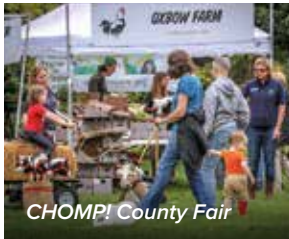
CHOMP! County Fair