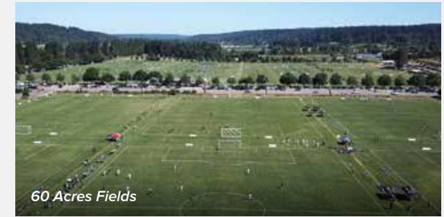
60 Acres Fields

Home to the world's smartest and most innovative technology leaders, Redmond offers a diverse and eclectic collection of event venues to enhance your next group gathering. With a unique array of indoor and outdoor spaces, meetings are more fun in Redmond.