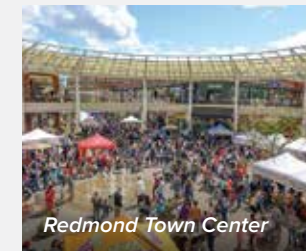
Redmond Town Center

Host your event in Redmond , and you may qualify for financial grant support. Be sure to apply for an annual tourism grant to offset your marketing expenses.