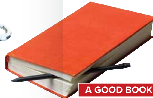
A GOOD BOOK

As you explore the vast array of outdoor activities, it's important to stay hydrated. Whether you are window shopping Downtown, biking our interconnected trails, or running in one of our community races, you'll always be close to the water.