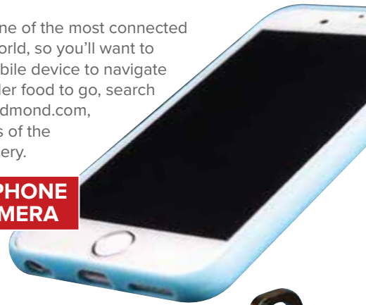
SMART PHONE WITH CAMERA

Redmond is known as the Bicycle Capital of the Northwest. We have over 40 miles of bike trails and a 75-mile bicycle system. Bring your bike, and be sure to pack a multi-tool to keep you rolling. Or, pick up the supplies you need at one of our incredible bicycle shops.