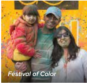
Festival of Color