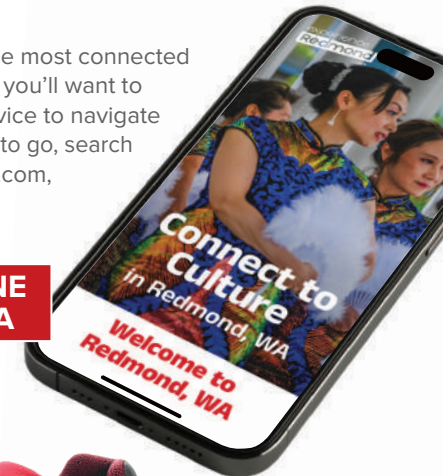
SMART PHONE WITH CAMERA

The Seattle region is world renowned for our love of the roasted bean, and Redmond's cup runneth over with a wide variety of coffee shops, cafes, and bakeries for you to find the perfect morning drink (or afternoon pick-me-up).