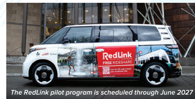
The RedLink pilot program is scheduled through June 2027